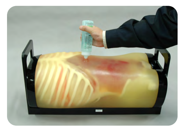
② Spread ultrasound gel over the phantom body.