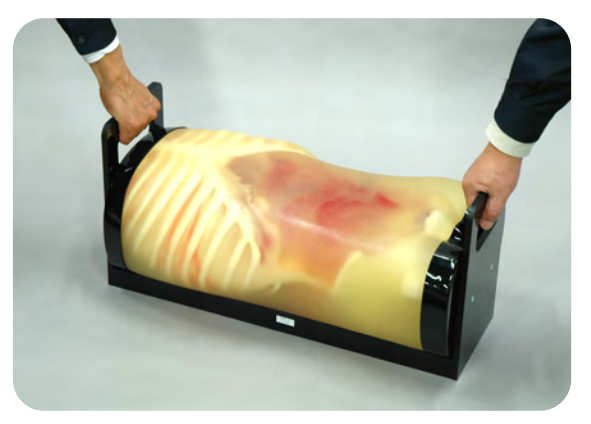
① The Phantom is heavy.For your safety,always carry the phantom with two people.