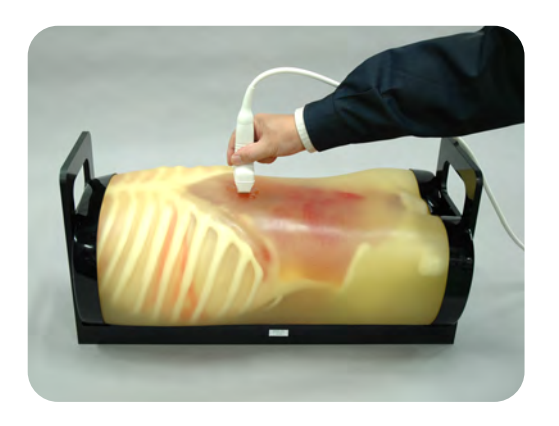
The phantom can be scanned with actual ultrasound devices.

* The map of simulated hemorrhages and tumors is on the backside of this manual.