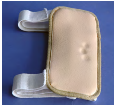
+ Light pitting Indentations with approx. 2mm depth