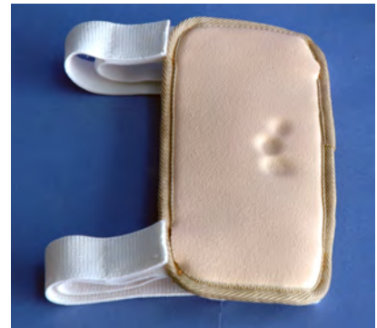
2+ Moderate pitting Indentations with approx. 4mm depth