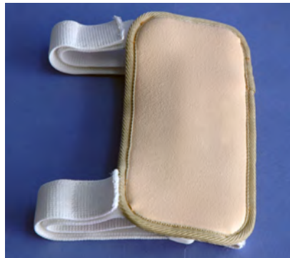
Normal No indentation left