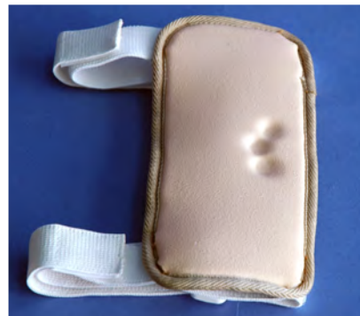
3+ Deep pitting Veins, bones and joints are indistinct because of swell. Indentations with approx. 6mm depth.