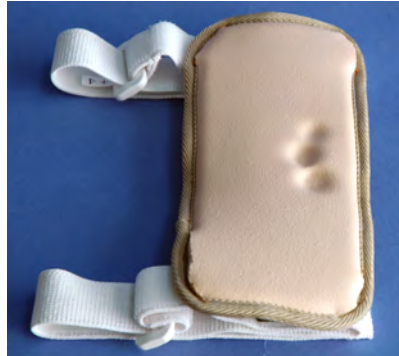
4+ Very deep pitting Indentations with approx. 8mm depth.